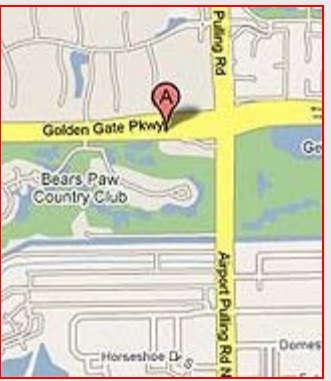
Poinciana Professional Park