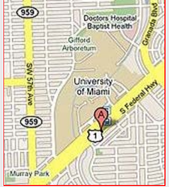
Gables One Tower